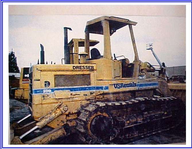
DRESSER MODEL 200 CRAWLER